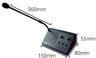
1 x Dual-way counter intercom